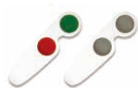
Red Green / Polarization Glasses

* Specification and design are subject to change without notice.