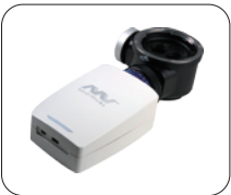
Firefly Digital Camera +Beam splitter

It's easy to upgrade your S360/S360S to a Digital Slit Lamp with Firefly Digital Module Kit (Firefly Digital Camera, Beam Splitter, MediView Software, USB Cable, Background Illumination Module)