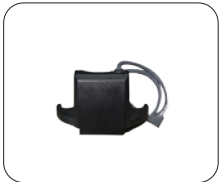
Background Illumination Module